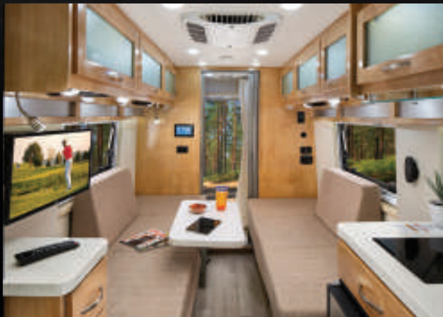
The versatile 20RB twin bed model has contemporary hardwood cabinetry and a spacious rear bath with a one-piece fiberglass shower. Nova's side windows open to increase ventilation.