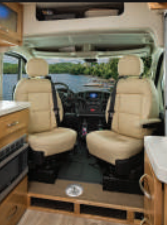
Swivel Captains chairs with removable table