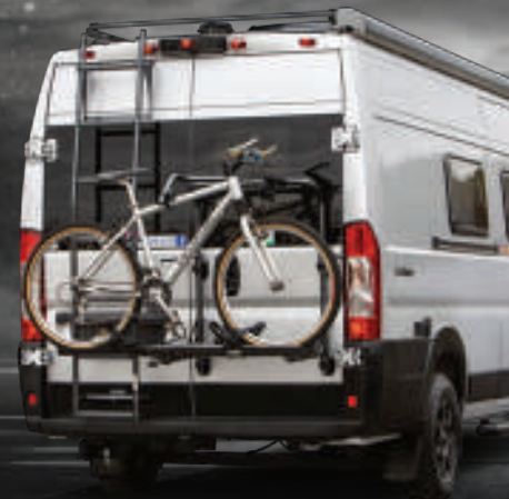
Optional bike rack