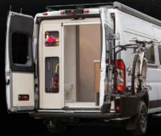
Easy to access rear bath and storage